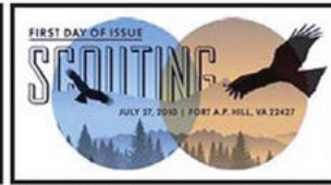
Designs of the Fort A.P. Hill, Va., pictorial first-day cancel and the digital color postmark for the Scouting stamp to be issued July 27.

and postal stationery have honored scouting.