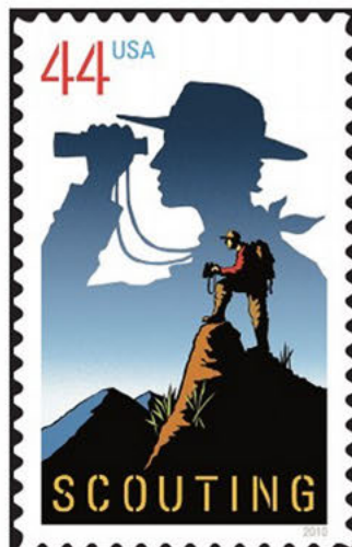
The United States 44¢ Scouting stamp to be issued July 27 at Fort A.P. Hill in Virginia.

The stamp's July 27 first-day ceremony will be held during the