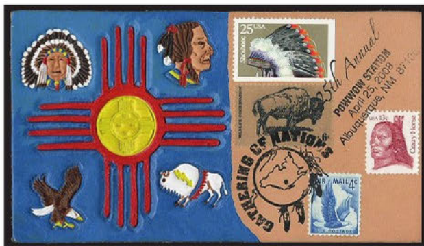
This painted, hand-tooled leather event cover for the Native American Gathering of Nations was the overall winner of the American First Day Cover Society's 2008 cachet contest.

The stamp obviously honors the Boy Scouts of America. This year is the group's centennial. The first-day ceremony is being held at the Boy Scouts' National Scout Jamboree. The figures on the stamp appear to be male, and the smaller one is wearing the red flannel jacket that, at least in the 1960s,