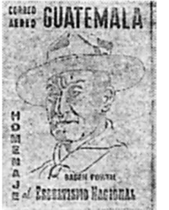
The designer's sketch

It is interesting to note that while some changes have been made in details, the basic design has remained.