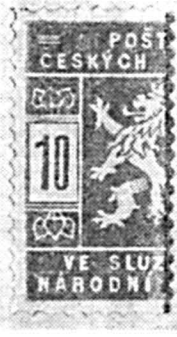
Figure 1 shows a portion of a stamp with the so-called "negative" perforation through the center of the stamp which is actually the mating portion of the paper which is cut off from the left side of the stamp die.

The Czech Scout stamps do not exist in pairs or blocks as they were printed singly from a single die. The stamp impression also cut the stamp from the paper with a colored edge. Postcards were issued in a limited quantity in the 10h. value only.