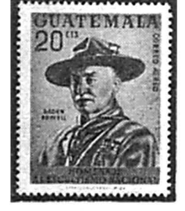
The stamp as issued

have ever been in Scouting. We have local chapters in many cities of the United States and Canada, and in several countries of the world.