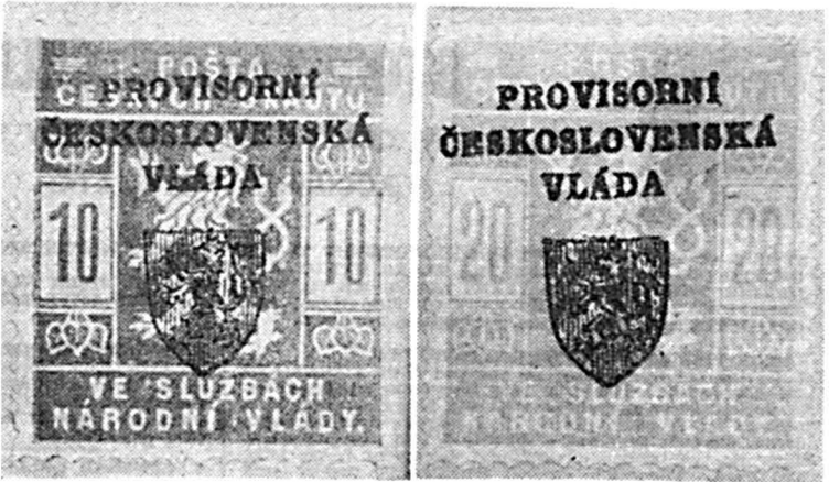
Figures 4 and 5 above and 3 constitute the "$64,000 question" in the author's collection. He is interested in learning facts about the printer(s), quantities issued, and general background of the overprints both with and without the crown atop the shield.

was defaced by filing grooves across the surface.