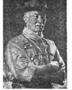
The original painting by David Jagger

Original artwork, suggested designs, stories behind the stamps, Scout cancellations, postage meter slogans, first day covers, rarities, die proofs, trial color proofs, errors, as well as postal stationery and the labels and seals that provide funds for Boy and Girl Scouts in many countries of the world?