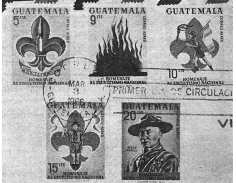
As seen on a first day cover, here are the five Baden-Powell stamps issued by Guatemala last March 3. The 20c (lower right) is the design discussed by the writer.