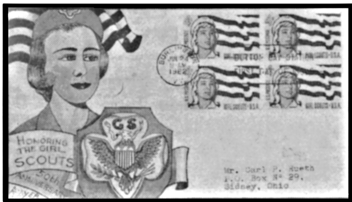
APPEAR TO BE SISTERS! The Girl Scout of the Girl Scout Commemorative released July 24 through the temporary "Button Bay" post office sub-station of Burlington, Vt., seems to be a sister of the one in the colorful hand-drawn cachet...