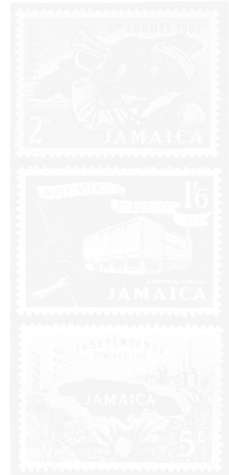
A set of four was released for the Independence Celebration. Identical designs are on the 2d and 4d, a Zouave Bugler; the 1/6 pictures Gordon House; the 5/- symbolizes Business, Industry and Agriculture.

the Commonwealth. The representatives of the British Government very willingly undertook to support Jamaica's application for membership.