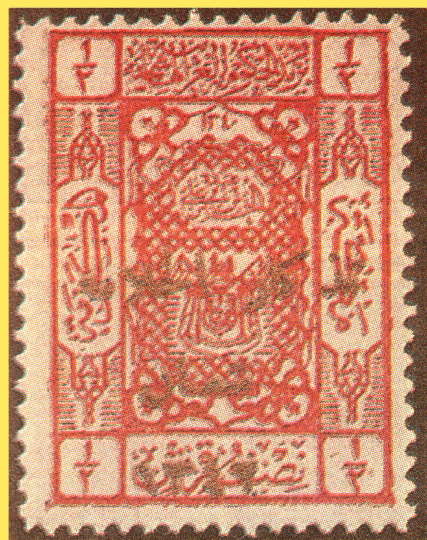
Harold Schultz continues his Saudi Arabia column with "The Hejaz-Caliphate Issue". See Page 5.