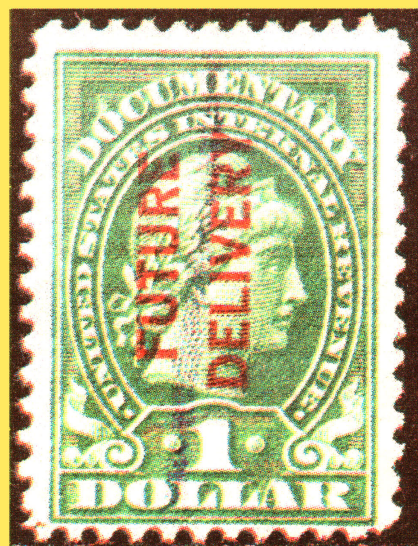
This month "X"=United States Revenues-Part III. Fred Wexler's column appears on Page 6.