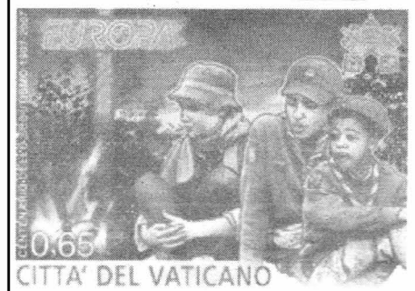
Europa's Centenary of Scouting stamps issued by Germany and the Vatican City (above) show both girls and boys engaged in Scouting activities.

I don't know where Scouting on Stamps would be ranked in a popularity poll of topical stamps, but with over 28 million boys, girls and adults involved in Scouting in 185 of the world's 192 independent countries, its rating would probably be very high.