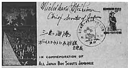
Scott #467 FDC with autograph of Chief Scout of Japan.

Many different possibilities exist that should lead to the use of the collectors' imagination. Whether the cover is really more valuable should not be the consideration. Rather, the personal satisfaction of knowing whether the autographs are genuine should be the collectors' reward as well as having "one of a kind."