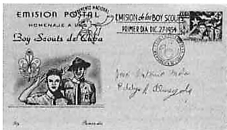
National patrol encampment of the Boy Scouts of Cuba, Scott #535.