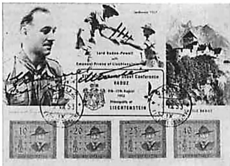
Lord Baden Powell is featured on Scott #270-3.