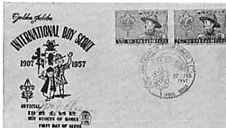
Korea honors 50th Anniversary with Scott #245-6.