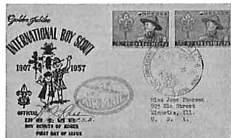
Korean official Scout First Day Cover.

The most popular FDC for Scouts include a Scout stamp, Scout cancel, Scout cachet and Scout label or seal. However, the cachet may be applied with a rubber stamp by a Boy Scout at a Jamboree and be considered more worthy and interesting than the best