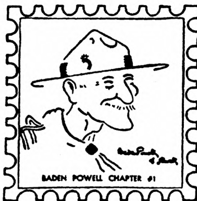
Figure 1. Logo of Baden-Powell Chapter #1 of SOSSI.