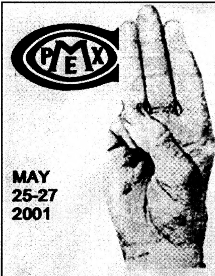
Figure 2: (Pictured To The Left) COMPEX Cachet for 2001 Show

Cachets were not a lot harder: the Boy Scout salute is an easily recognized emblem of scouting, that has appeared on a U.S. Stamp (Scott #1145). One of the members of the COMPEX Board provided the appropriate artwork.