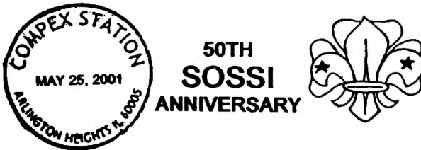
Figure 1: USPS Show Cancel for COMPEX 2001

The design of the Complex 2001 USPS cancellation was easy: the show is hosting Scouts on Stamps Society International (SOSSI) on its 50th Anniversary. Hence the cancellation shows the SOSSI logo and notes that it's SOSSI's 50th Anniversary.