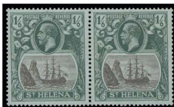
SAINT HELENA SG93b NH torn flag in pair with normal $625

Visit our website Browse, Search, and Order securely from our Online Price List at www.arhstamps.com