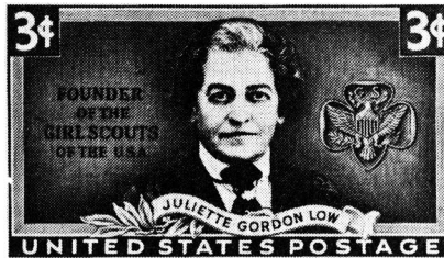
In 1949, Juliette Gordon Low, founder of the US Girl Scout movement, was honored with this U.S. 3c green stamp.

In 1908, Robert, Lord Baden-Powell founded the Boy Scout Movement in England. The following year, 1909 a Boy Scout Rally was held at the Crystal Palace in London. Eleven thousand boys paraded at the event. Much to Baden-Powell's surprise several girls, calling themselves Girl Scouts, also attended. They were determined to be a part of the Scouting Movement. Baden-Powell decided that if they were to be a part of the movement, they needed a name and a program of their own. Shortly after the Rally, in 1909, "A Scheme for Girl Guides — A Suggestion for Character Training for Girls" was published. In 1910 the Girl Guides Association was officially founded under the presidency of Agnes Baden-Powell, Sir Robert's sister. The two Scouting founders collaborated on the first handbook for Girl Guides. The handbook was used by girls