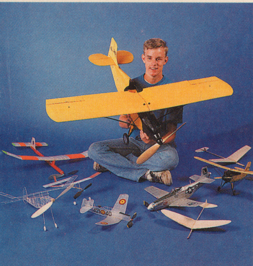
Model airplanes come in all sizes.

thing. Would you believe there's a Society of Inkwell Collectors? A Spark Plug Collectors of America? An International Brick Collectors' Association?