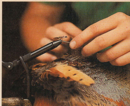
Fishing is a popular hobby. Save money by tying your own flies.

Look for hobbyists among the troop's merit badge counselors. Many of the Boy Scouts of America's more than 100 merit