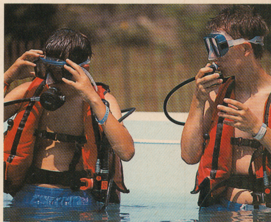
Learn to scuba dive with a buddy and discover a whole new world underwater.