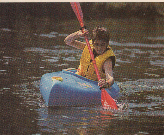
Sports like kayaking are hobbies too.