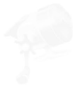
The 1700ll push button reel is also available separately.

Be a fishing champ...without paying a king's ransom!