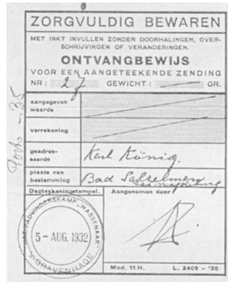
A postal receipt validated with the special Scout cancel from the 1932 National Scout Camp in the Netherlands. An interesting example of philatelic peripherals

A collector could just collect the perforate variety of the stamps without the imperforate types, souvenir sheets and all the rest