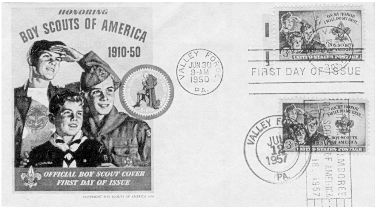
A 1950 US National Jamboree First Day Cover canceled at both the 1950 and 1957 National Jamborees. A cover with a unique history that could be added to any collection for less than the price of two first run movie tickets. A great item for a collector expanding his/her collection, or a young collector starting out in the hobby