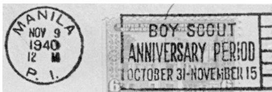
An example of an advertising slogan cancel used in the Philippines immediately prior to World War 2. Could the sender have imagined the events of the next year that would change the world forever?

Let's even consider Picture Postcards. Here again, most are not philatelic in nature, but many have been used through the mail, making for often interesting usage. The collecting of Scout Picture Postcards is very popular in Europe. Many cards bringing a very good price. They are interesting for their often unique views into the past for us to enjoy today. They often remind us of the ideals and thinking of Scouting in the founders' time.