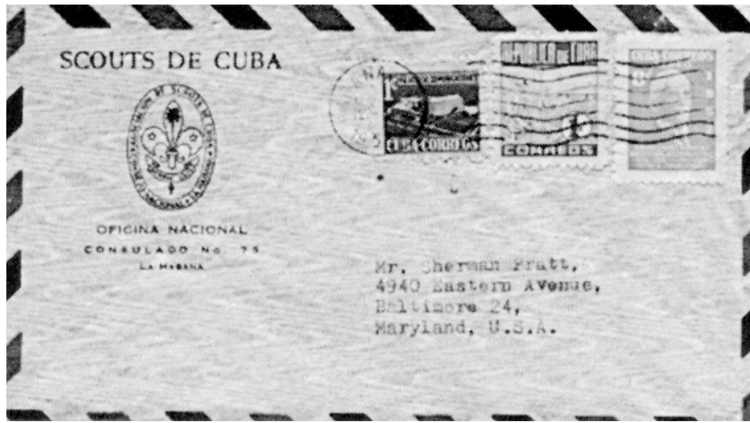
A Cuban Scout 'Corner Card' from the National Council. A nice example of the type, interesting and inexpensive as well!

on them from both within the Scouting organizations and from business and industries that have supported Scouting throughout the years. These come from all over the nations of the world where Scouting is present. Many of them difficult to find for most are on ordinary business type mail that collectors do not see and are thrown away. The Journal now has a monthly column devoted to this under studied area of collecting. This could be a real hunt for the elusive and yet not expensive items to collect in most cases.